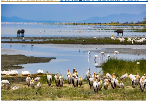
Lake Manyara National Park

After breakfast, check-out and you will be driven to Lake Manyara National Park (approx. 06hrs), experience a welcoming Game Drive prior to check-in.